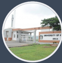
University of Abuja Nigeria