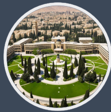
The University of Jordan Jordan