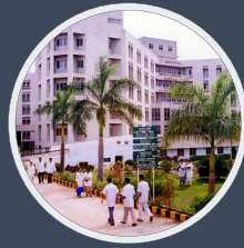
Saveetha Dental College and Hospitals (SIMATS) India