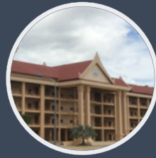
University of Health Sciences Lao People's Democratic Republic