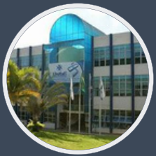
Universidade Deferal de Aldenas (UNIFAL) Brazil

This month, we welcome six new University members: